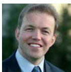
David Burrowes Enfield Southgate MP

We deserve our Hospital. We need our Hospital. We've paid for our Hospital. We don't want it decimated by cuts or closed entirely. But we have to fight to save it. It's time we told this Labour Government - Hands Off Our Hospital!